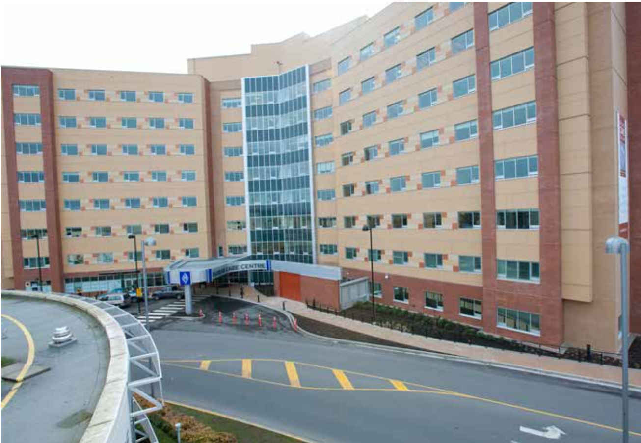
→ Royal Jubilee Hospital. Victoria, British Columbia

With a program based on an APPA Standard, ACCIONA's Mobile Fleet Services provides housekeeping/janitorial services for multi-use facilities including fitness centres, offices, and transit exchanges.