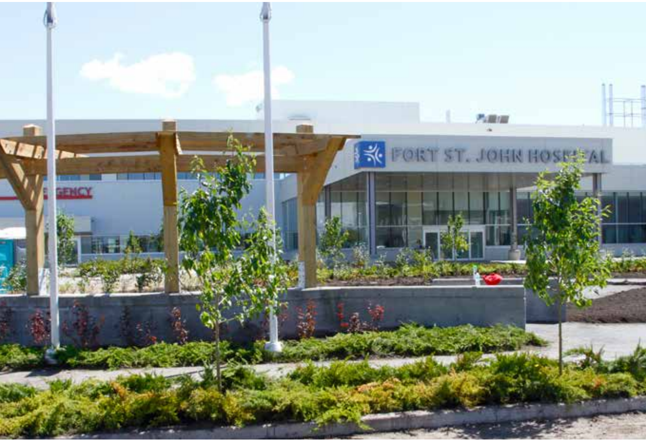
→ Fort Saint John Hospital, British Columbia

The Royal Jubilee Hospital Patient Care in Victoria BC and the Fort St John Hospital are an example where the project team's focus on sustainability helped the facility achieve LEED Gold Certification.