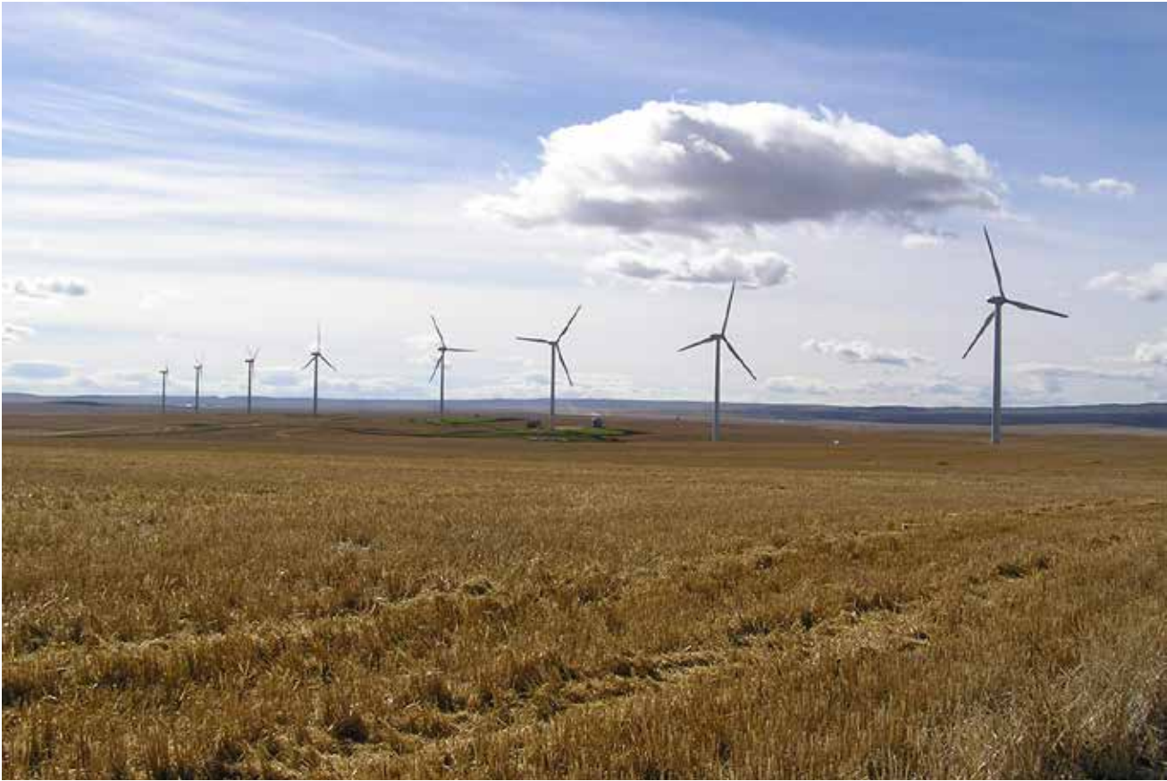
→ Magrath Wind Farm, Lethbridge, Alberta

In addition to engineering, construction and installation service, we also have expertise in turbine manufacturing, a value added service which we provide to our clients. Currently, ACCIONA owns 14 operational wind farms in North America, with a total capacity of over 1400 MW (181 MW of which are produced in Canada).